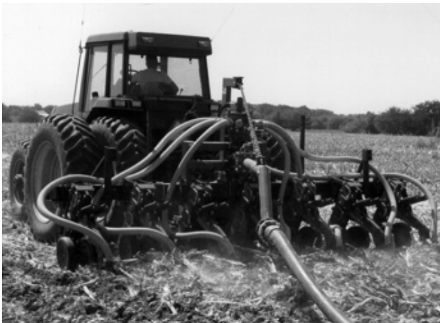
Dragline application of liquid manure.

This is the estimated amount of nitrogen that will be released from the lagoon effluent in the second year after application.