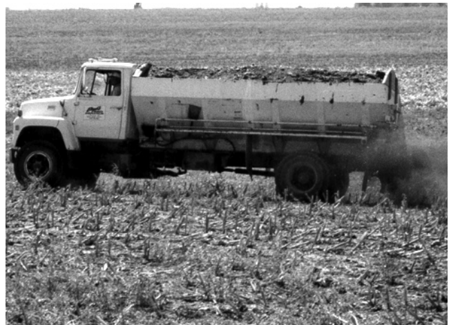
Truck-mounted applicator of solid manure.