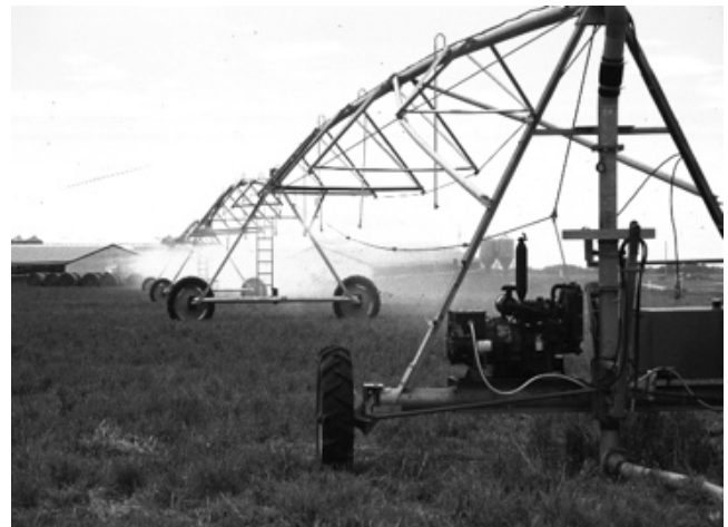
Center-pivot irrigation system for applying liquid manure.

Manure contains both organic nitrogen and mineral forms of nitrogen. The organic nitrogen is an integral component of cells in organic material in the