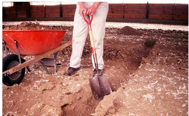
Figure 3. The trench method. Use the blade of the shovel to chop the cake so the trench has square sides down to just above the soil surface.