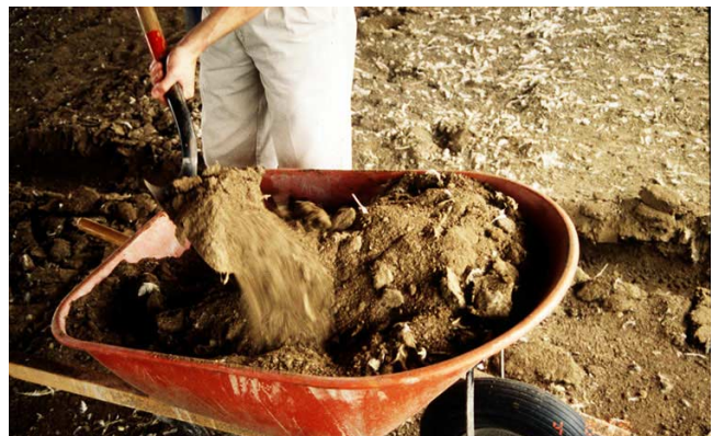
Figure 4. Be sure to crumble chunks of caked litter into small pieces and thoroughly mix the litter before removing your sample.

Often the amount of material collected from the two trenches will exceed the capacity of the wheelbarrow. When this happens, crumble and thoroughly mix the material in the wheelbarrow each time it is two-thirds full with material from the trenches. After mixing, place one shovelful in the 5-gallon bucket,